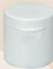
18-C W23 H22