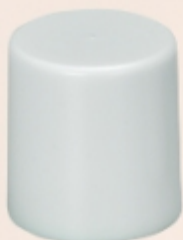
QA-18 W23 H24