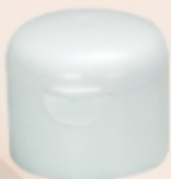
24-A W29 H23.6