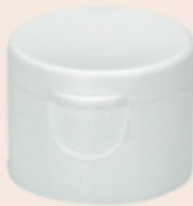
24-B W34.7 H24