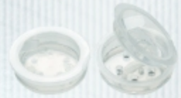
31mm C W26 H6 PAT.