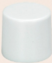
QA-24 W28.9 H25.7