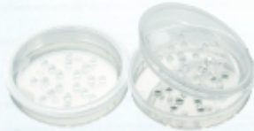
50mm C W43 H8 PAT.