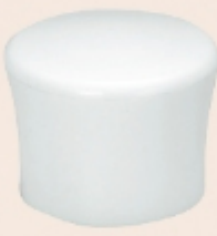
QB-24 W33.6 H27