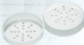
50mm A-1 W45 H8