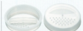
68mm B W64 H13