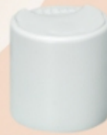
24-E W28.5 H26.6