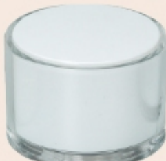
QD-41 W41 H28.6