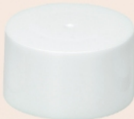
QC-46 W45 H25