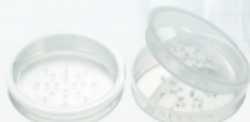
86mm C W80 H16 PAT.