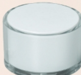
QD-46 W46 H28.6