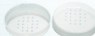
68mm A-2 W63 H12