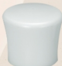
QB-18 W27.6 H25