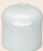
18-A W24 H20.8