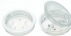
38mm C W33 H6 PAT.