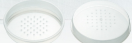
110mm A W102.9 H16.2