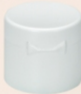
24-C W31.7 H25.9