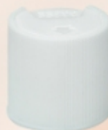
24-D W27.3 H27.2