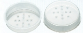
45mm A-1 W39 H8