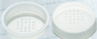
56mm A-3 W49 H11