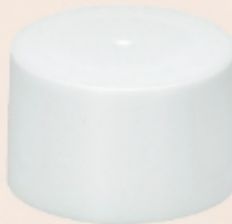
QC-41 W40 H25