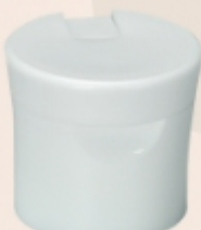
18-B W23.3 H21.1