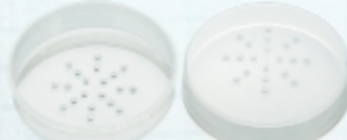
68mm A-1 W64 H12